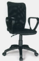
Nano MB With Arms