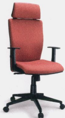
Apollo HB With Head Rest